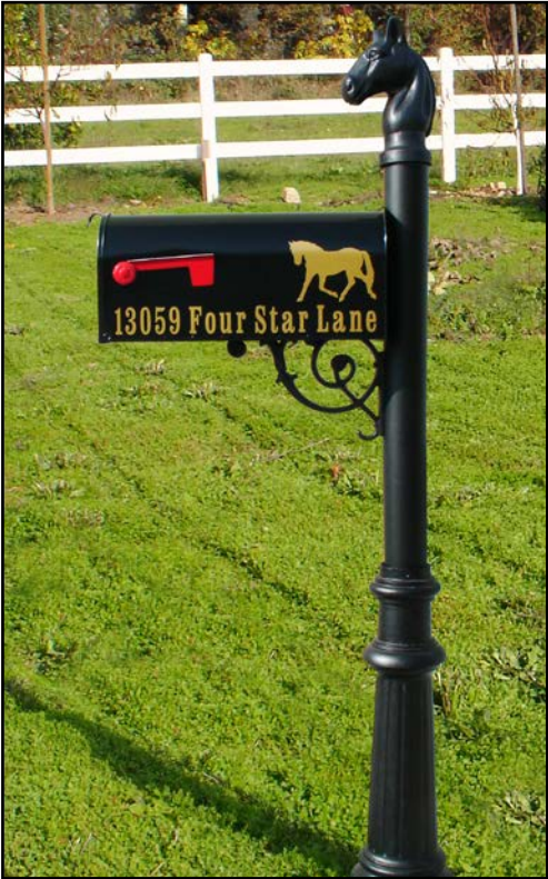
LPST-801-E1-BL Economy Mailbox: Shown with Fluted Post and Large Horsehead Finial. Direct burial pole height 5' 2".