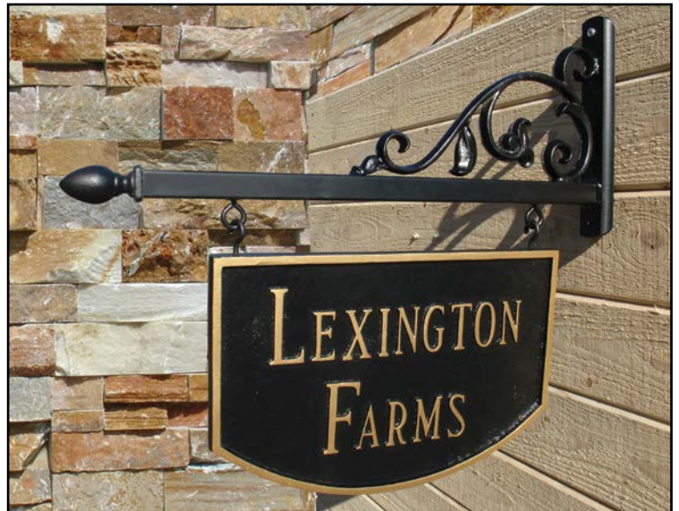
BRNSGN-TSP1 Double Sided Hanging Barn Sign with Scroll Arm: Sign 15-1/2" x 10-1/4". Overall 23-1/2" x 21-1/2" x 2".