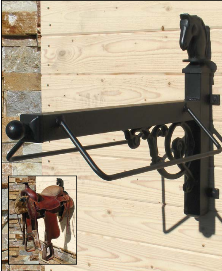
SDLRCK-HRS1 Saddle Rack, single. 28-1/2" x 22" x 11". SDLRCK-HRS3 Saddle Rack, triple. 28-1/2" x 72" x 11".

Prolong the life of your saddles by storing them on a horse saddle rack. Features cast aluminum and steel construction with a tough powder coat black finish.