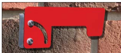
Stainless Steel Masonry Flag with bracket. Flag dimensions: 1-1/2" x 7". (MF-1450)