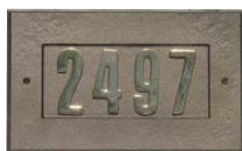
Matching cast aluminum address plaque: 3" gold polished brass numbers. 11" x 6-1/2". (ADD-1410)