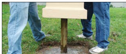
Stucco column ready to install over 4" x 4" post.