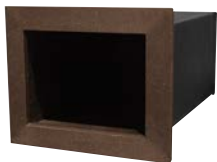
Newspaper box: aluminum frame with black masonry box. Frame: 11" x 9-1/4". Insert: 9" x 7" x 15-3/4". (NEW-1415)