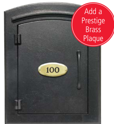
Add a Prestige brass plaque from page 23.