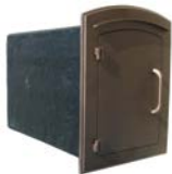
Oversized masonry box included