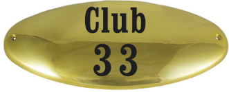
Large Oval Plaque 10 3/4" X 5 1/8" P5002 2 Lines of text* MSRP $129.00

* Additional lines of text or numbers are available for a charge of $15.00 per line.