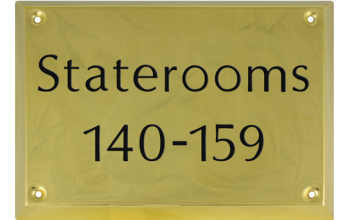
Square Plaque 8" X 5 3/4" P4002 2 Lines of text* MSRP $129.00