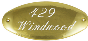
Medium Oval Plaque 7 1/2" X 3 1/2" P5001 1 Line of text* MSRP $79.00