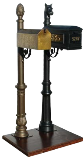
Double Post Floor Display (#DISP-DPF)