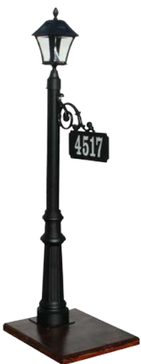
Single Post Floor Display (#DISP-SPF)