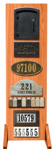
Freestanding Floor Display (#DISP-COMBO-F)